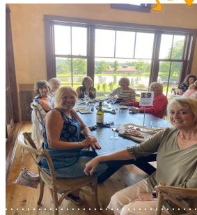
Mix and Mingle at Laurentia Winery